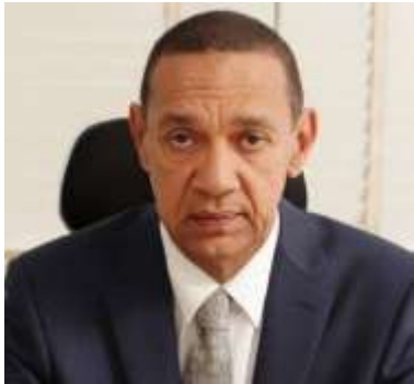
Ben Murray-Bruce Chairman

Benedict Murray-Bruce is a Nigerian business magnate and politician. He is the founder of Silverbird Group. A member of the People's Democratic Party, he was elected to the Senate of Nigeria in March 2015, where he represented the Bayelsa East Senatorial District.